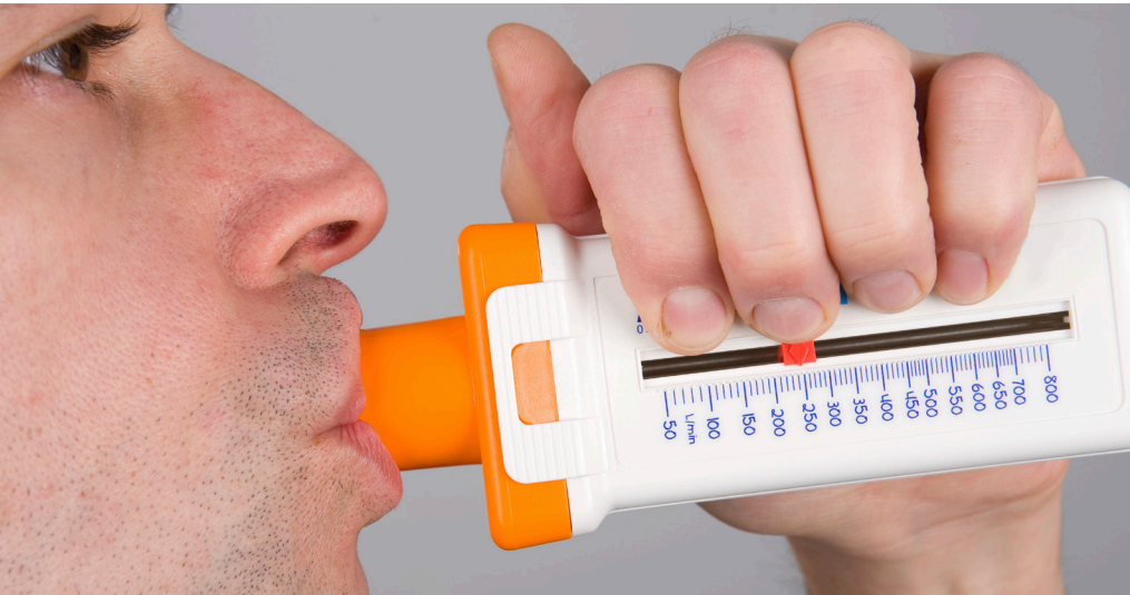
A peak flow test measures how hard you can breathe out. It is a common test used in all types of asthma.

called personalized medicine. Traditionally, the same medicines have been used to treat everyone with asthma. This new approach of categorizing subtypes of asthma looks for biomarkers to identify each subtype. Currently, four subtypes have been identified, ranging from mild to very severe asthma. In theory, corticosteroids may not work best for each subtype. Also, obesity, smoking, or infections